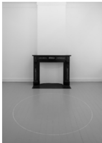
Ian Wilson , Circle on the floor (1968), installation view taken during Ian Wilson's solo show at the gallery beginning of 2019.

‘[I]nknowable’ ‘absolute knowledge’ or ‘perfect’ others, like Section 30 , were an attempt to sum- n between the known and the unknown.