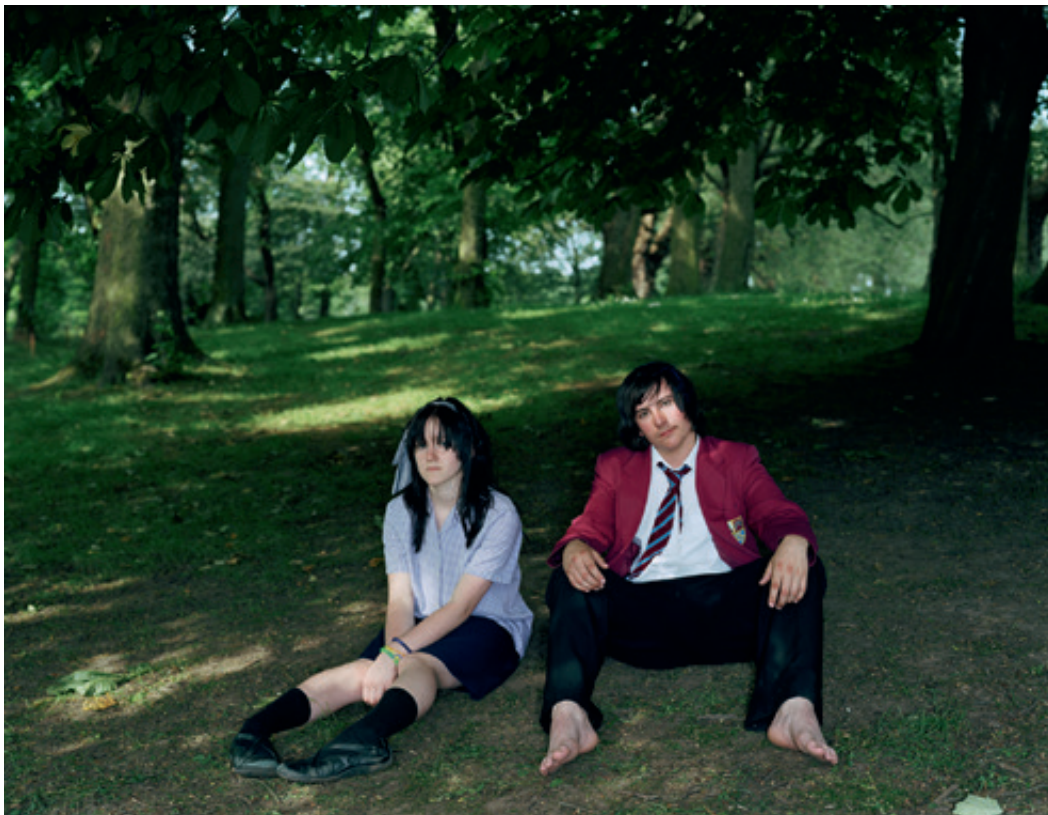
BRUSSELS, MAR. 19 – On April 24th the gallery will open a solo exhibition with recent and older works by Rineke Dijkstra , including this park portrait Sefton Park, Liverpool, June 10, 2006 A .

Dialectic of tentativeness with inclusivity and F t l c i c F C Visible surface of minimalist cube exposed g cube exposed the hidden conditions of its s : e e i s s e Campaigns time leaving place for something to flicker as if an intangible digital image, s e d d d d d s C G the meta grid reveals nothing at all. e e f d t d s g