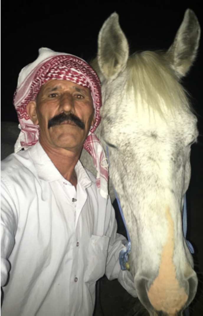
Francis Alijs, Salam tristesse , 2018. Courtesy of the artist and the Ruya Foundation, Baghdad.

MEXICO CITY, MAR. 15 – Since 2016 Francis Alijs has been working on a complex ensemble of videos, paintings, drawings, found objects etc. which were produced in Mosul and in refugee camps in the province of Duhok in collaboration with the Yazidi community. The image above relates to the video entitled Salam tristesse and pictures one of two older men filmed during their tender encounter with a horse. Filmed at night, the mere presence of the horse allows the men to unleash their emotions and express the disillusion with humanity. The ensemble explores numerous themes, both historic and contemporary in the larger “story” of Iraq, from the creation of the nation at the beginning of the 20th century against an Anglo-French colonial background, to the American encounter, and its impact on the geographic unravelling of the Iraqi state with the war, by and against ISIS since 2014. The project is realised upon the invitation of the Ruya Foundation.