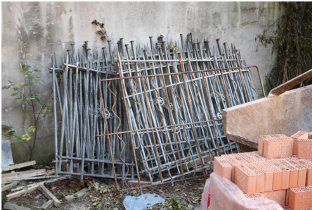
BRUSSELS, SEP. 2018 – Sven Augustijnen recuperated the bars on the windows of the Office de Sécurité sociale d'outre-mer (OSSOM), previously the building of the Loterie coloniale, at the corner of the avenue Louise, the rue Lesbroussart and the rue Henri Spaak in Brussels, as part of an upcoming installation entitled L'Internationale .