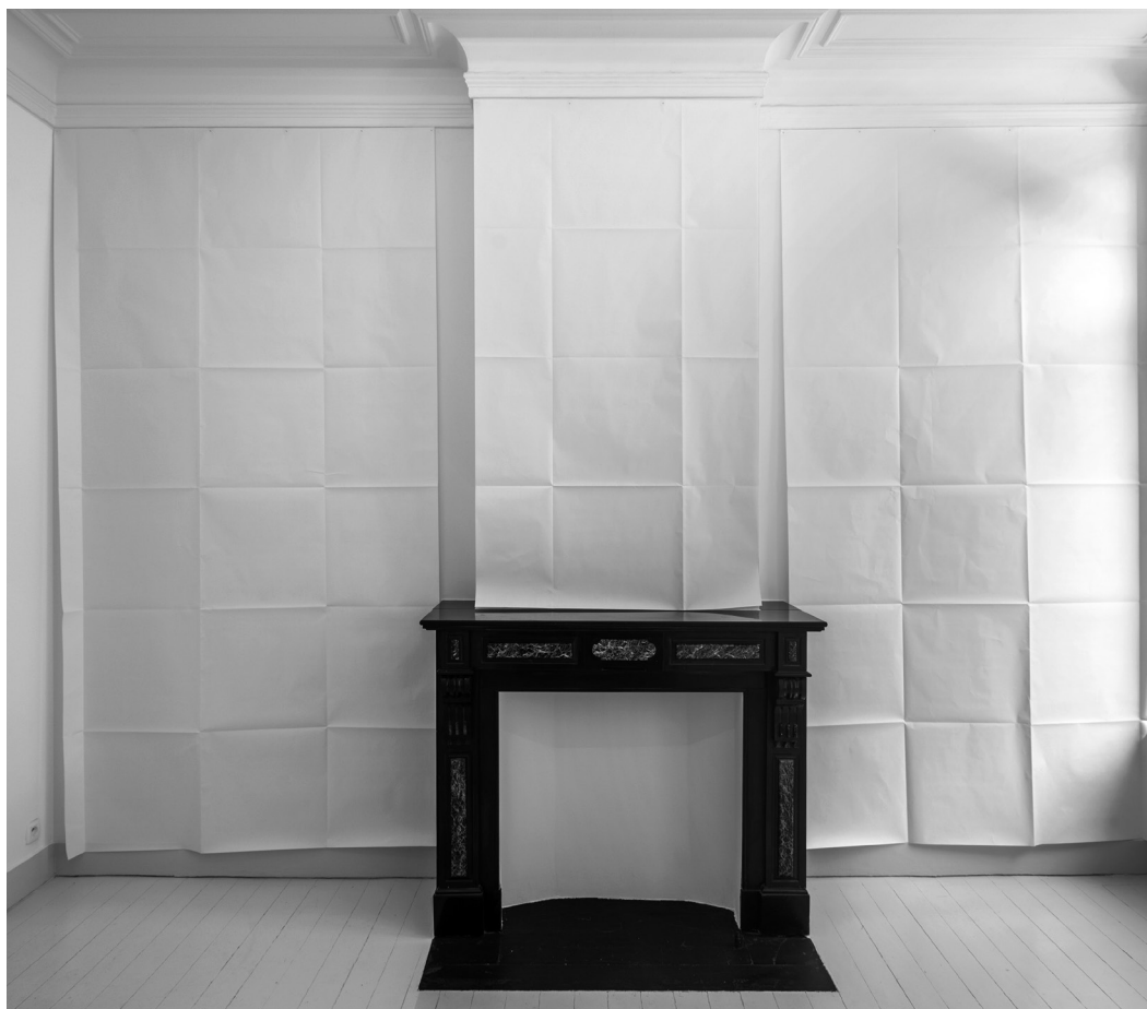
David Lamelas, Murs pliés / Gevouwen muren , Installation view at Jan Mot, Brussels (June-July 2018).