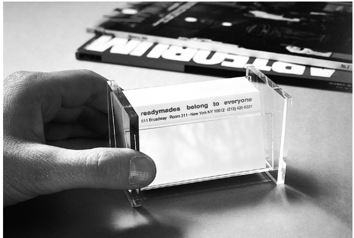
Jay Chiat, Insight , 1989, color photograph, plexi title card, 124 x 185 x 5 cm (frame), 4,5 x 11 cm (title card)

readymades belong to everyone®, Philippe Thomas declines his identity, MACRO – Museum of Contemporary Art of Rome, with works by Christopher D'Arcangelo, Claire Fontaine, The Office of Fend, Fitzgibbon, Holzer, Nadin, Prince & Winters, 28/10–12/03.