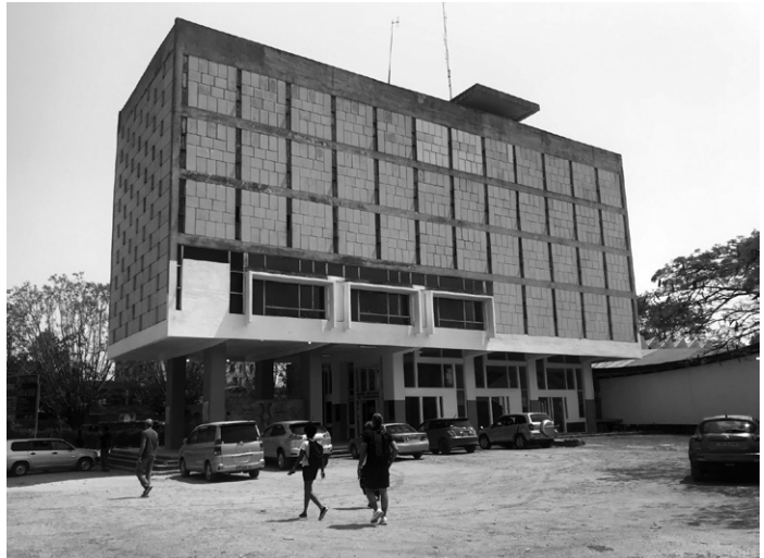
Musée national de Lubumbashi, 2022, DR Congo.