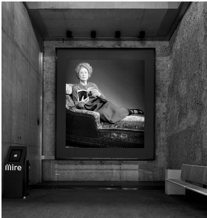
Dominique Gonzalez-Foerster, Foxyne, Chêne-Bourg station, Geneva (CH), 2022.

Foxyne , a new "apparition" by Dominique Gonzalez-Foerster is presented at the Chêne-Bourg train station in Geneva. Taking as a starting point Lady into Fox , a novel by David Garnett written in 1922, Dominique Gonzalez-Foerster offers to follow a singular transformation in several sequences. The text relates the story of a woman who transforms herself into a fox. Despite the efforts of those around her, she gradually joins the wild world and takes on all the dangers inherent in it.