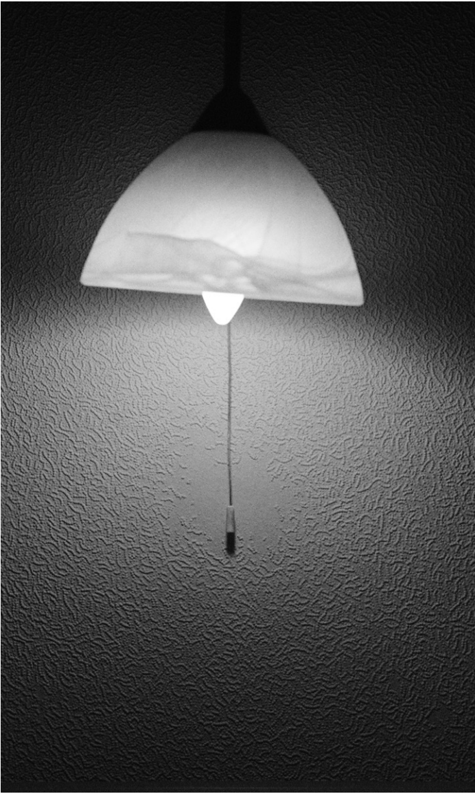
ONE PULL. Photo of a bed lamp I took in my hotel room in Kyiv when I was preparing the show in PinchukArtCentre. Every time when the guests pull the string to turn on the light, they slowly polish a bit of the wall texture away. The hotel was built in 1979 for the 1980 Summer Olympic. It was called Hotel Rus. — Trevor Yeung

Trevor Yeung's solo show at the gallery is planned for 2023. ( https://trevoryeung.net )